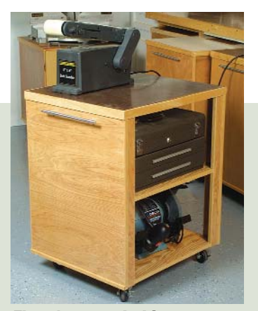
There's no such thing as too much storage. Two tall, open shelves are used for storing large objects such as a toolbox, benchtop grinder, and belt sander.