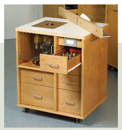
Router table holds parts and accessories. This rolling router table is equipped with a router lift. The lift is offset to accommodate drawers, bits, and accessories. Dust-collection ports are built into the fence and cabinet back.