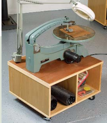
Scrollsaw sits at a comfortable height. The scrollsaw is mounted to this low rolling cabinet so that it can fit below the workbench when not in use. However, it's just the right height to use while sitting comfortably in a chair.