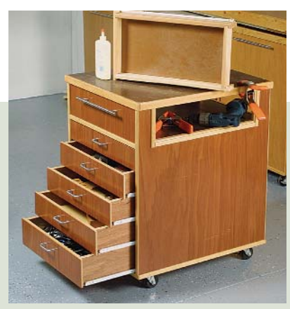
Shallow drawers hold hand tools. An open area below the top of the cabinet keeps tools within reach but out of the way. The cabinet's top has enough overhang for attaching clamps.

After taking up as much space as I could afford on the ground, I looked to the walls for more storage. I designed the wall cabinets to accommodate my work habits. I did not want deep cabinets, as things tend to get shoved to the back and become lost. I wanted